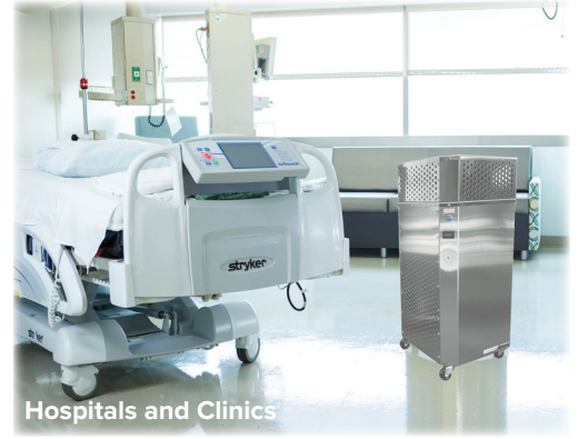
Hospitals and Clinics